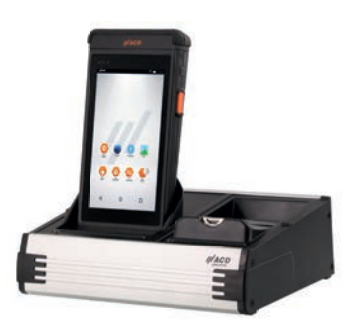
M2Smart®SE in Cradle