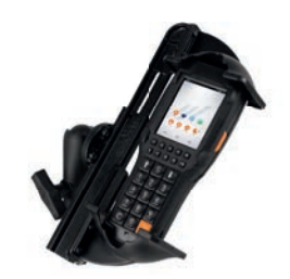
M270 RAM Mount