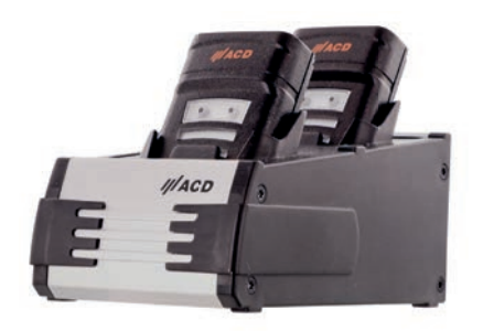
2 HasciSE units in charging cradle

Compatibility with all BT-enabled devices: BT 4.0 and above